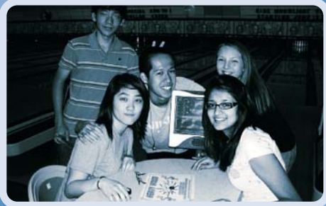
Members of Dayton AAYAT pose during a stand "Thank You Section" bowling event on June 16.