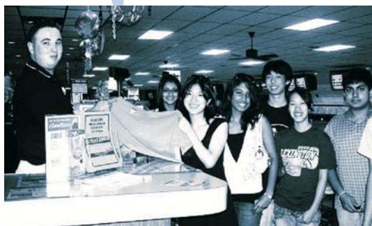
Dayton AAYAT interns present a DEBUNKIFY t-shirt to the manager at Poelking Woodman Lanes in Kettering.

Throughout the summer months, several AAYAT chapters hosted stand "Thank You Section" events to show their support and thank area businesses for their continued compliance with Ohio's new smoke-free law.