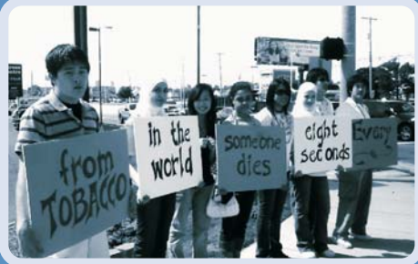
Akron AAYAT holds up signage along Medina Rd. in Montrose during a "Day of Activism" on September 1.