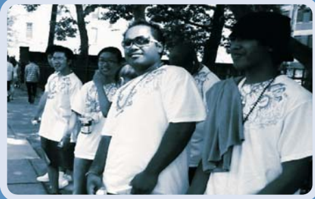
Members of Cleveland AAYAT pose for picture while passing out tobacco information before a Cleveland Indians game on August 4.