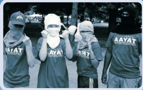
Ninjas and tobacco advocates!!! Columbus AAYAT interns in costume after a skit at the Asian Festival in May.