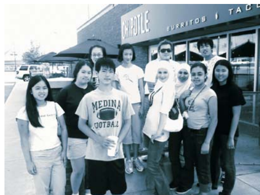
Akron AAYAT and ACCC youth at Chipotle in Montrose.

On September 1, Akron AAYAT hosted their second "Thank You Section" event at Chipotle in the Montrose shopping district. Team members held up tobacco signage along Medina Rd., hosted a laser tag competition nearby, and then moved to Chipotle for a late afternoon snack to pass out items to patrons and present the store management with a certificate of appreciation. Akron AAYAT would like to thank youth from the Akron Chinese Christian Church, Montrose Chipotle, and Laser Quest Akron for their support of the event.